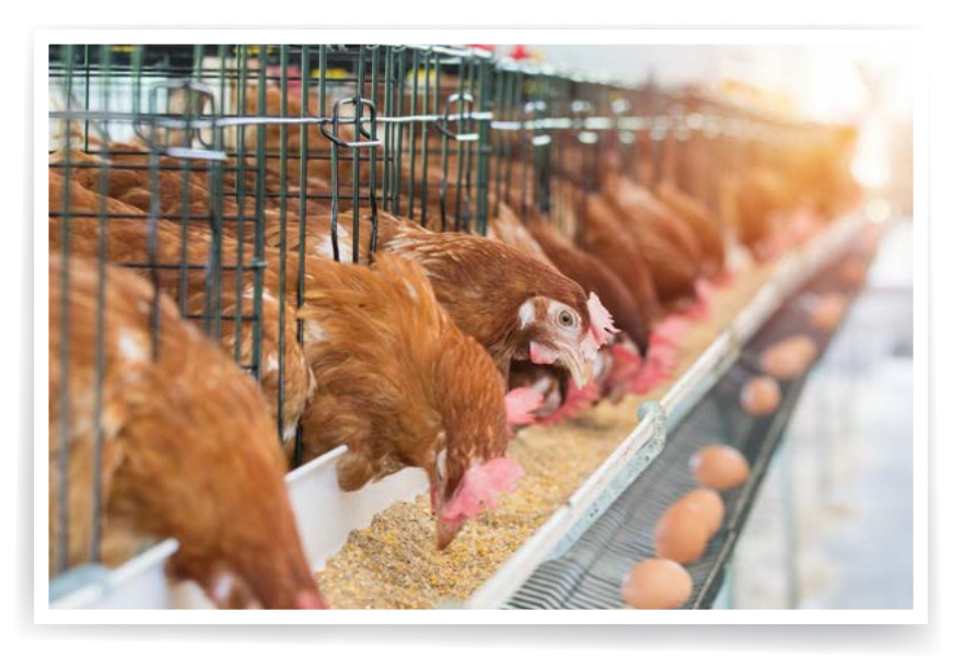
Just as what you eat affects your health, what animals eat also affects their health. In turn this impacts the health of their meat, eggs, and milk, which you then eat!

Highly-polluting factory farms (also called CAFOs) raise animals in extremely confined areas, feeding them an unnatural diet of GMO soy and corn while pumping them full of antibiotics and hormones, and voila... your dinner is served!